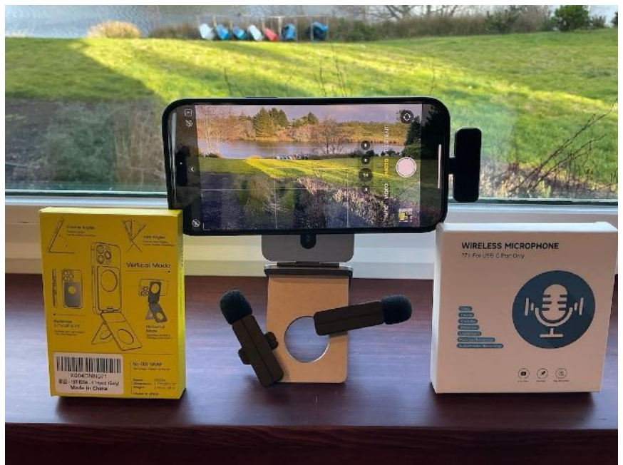
Fig. 2. My professional recording equipment.

archive.org/details/seaside-history-and-hops-presentation