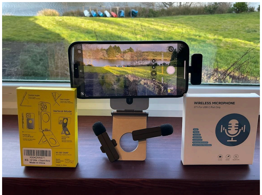
Fig. 2. My professional recording equipment.

archive.org/details/seaside-history-and-hops-presentation